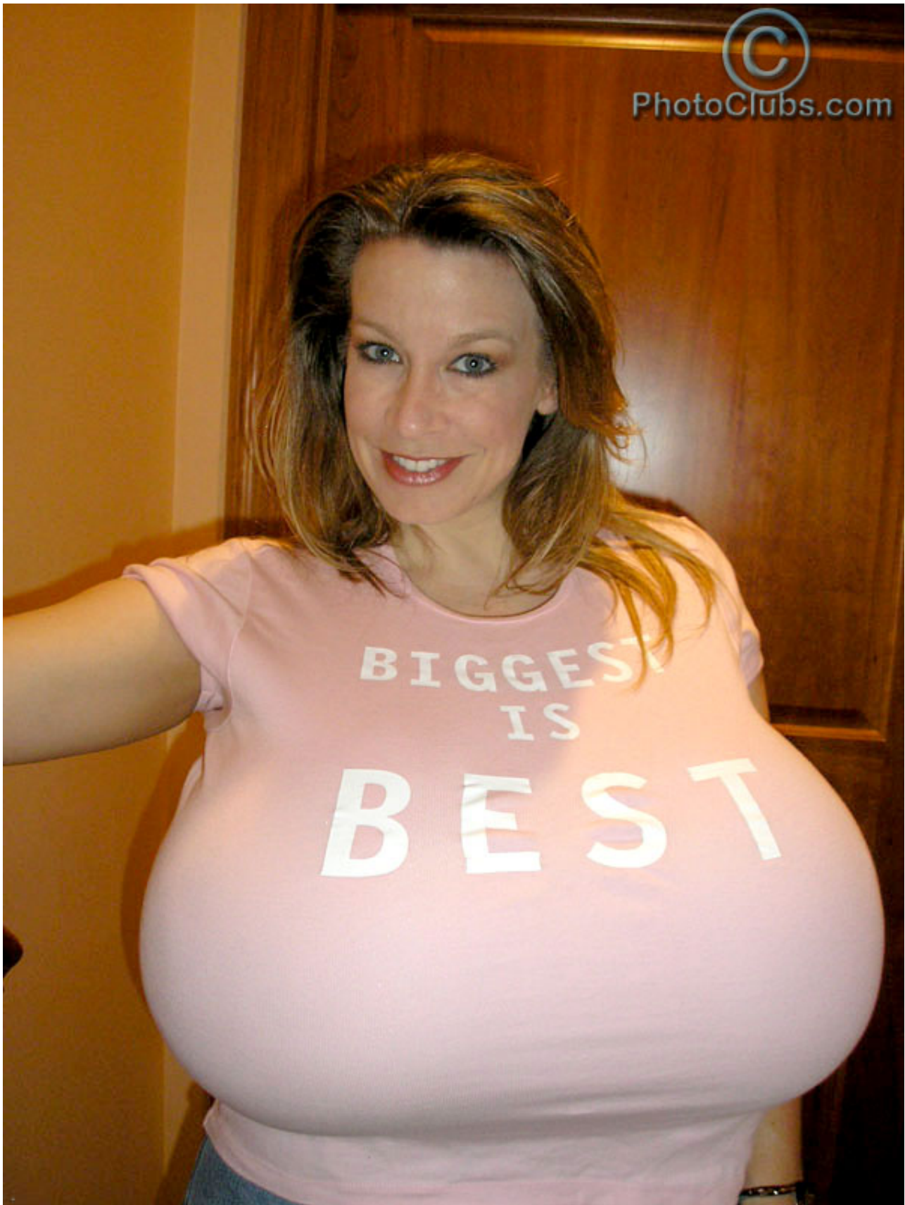
Chelsea Charms Photoclubs Site Rip